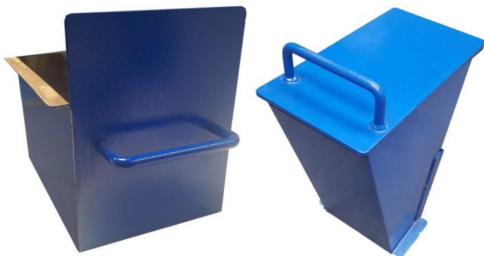
Collector bottom and infeed hopper