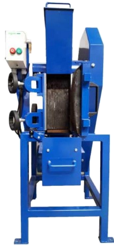
LMC100D Jaw Crusher horizontal door (standard)