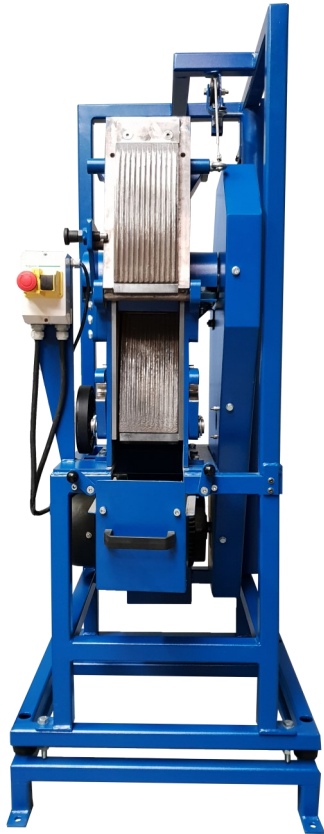
LMC100VD Jaw Crusher vertical door