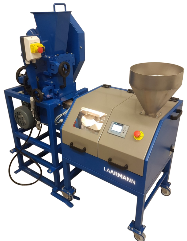
Jaw Crusher with Rotary Sample Divider combination