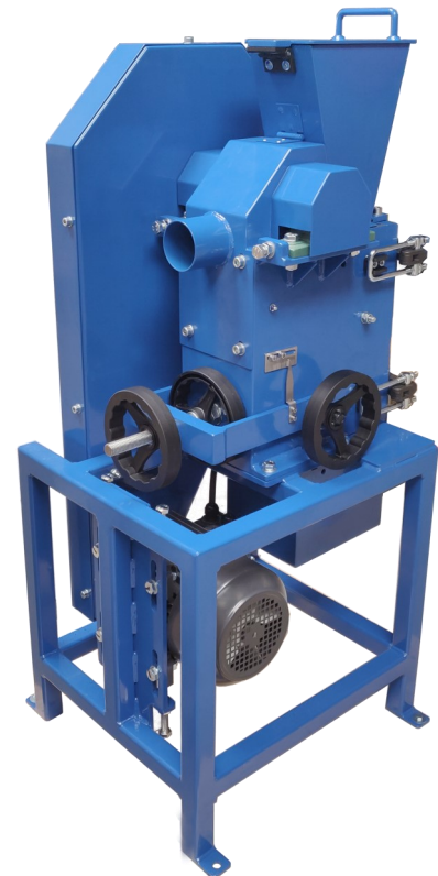
LMC100D jaw crusher side view