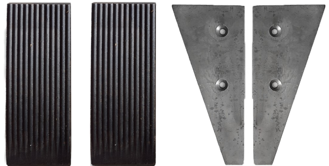
Jaw plates and Side liners