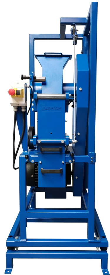
LMC100VD jaw crusher vertical door custom made